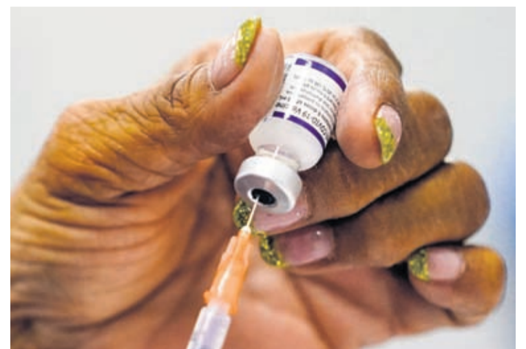
A syringe is prepared with the Pfizer COVID-19 vaccine at a vaccination clinic at the Keystone First Wellness Center in Chester, Pa., Wednesday, Dec. 15, 2021.

The Biden administration's vaccine requirement applies to companies with 100 or more employees and covers about 84 million U.S. workers. Employees who are not fully vaccinated have to wear face masks and be subject to weekly COVID-19 tests. There are exceptions, including for those who work outdoors or